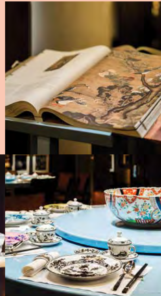
Colourful Hand-painted Italian Tableware