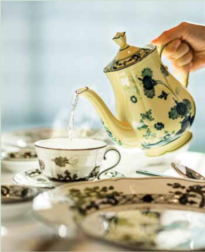
A Refined Tea Experience

These teas and other artisanal tea accoutrements are available for purchase should you wish to replicate the tea experience at home.