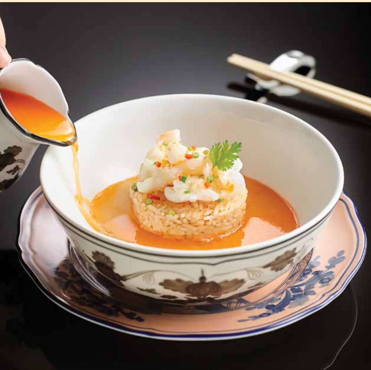
Poached Rice with Canadian Lobster