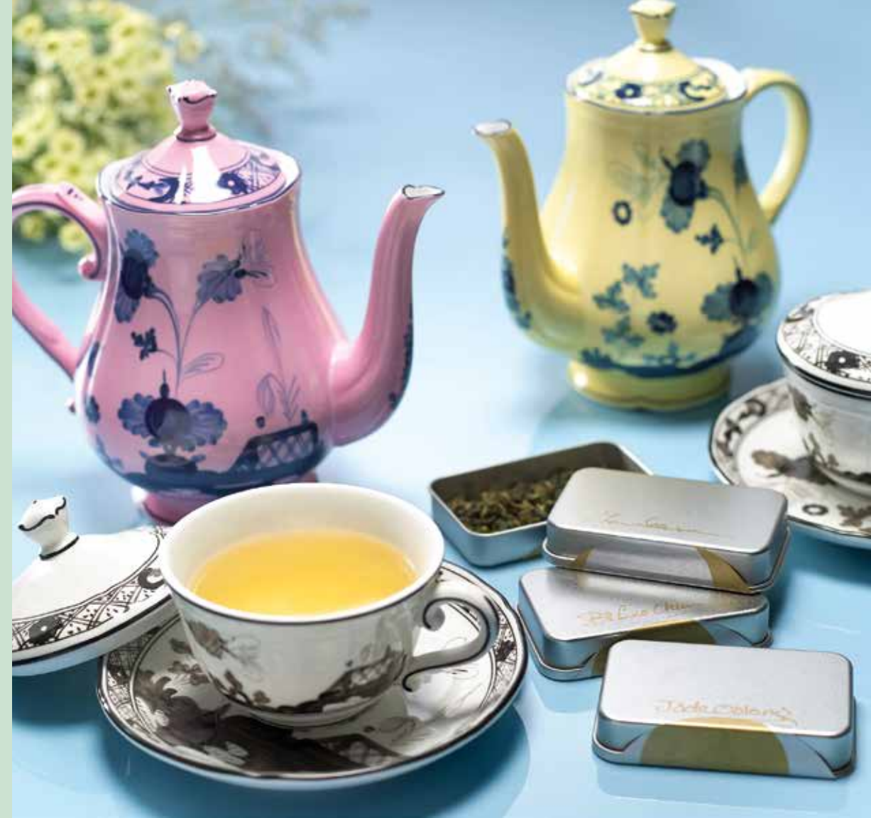
Specialty Teas from Tea Bone Zen Mind