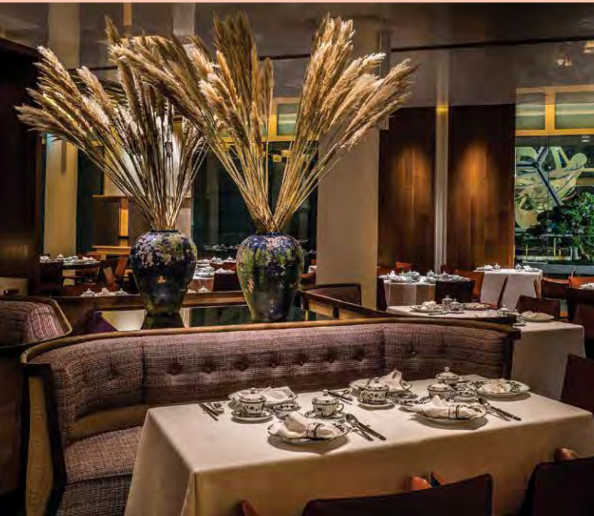
Main Dining Hall