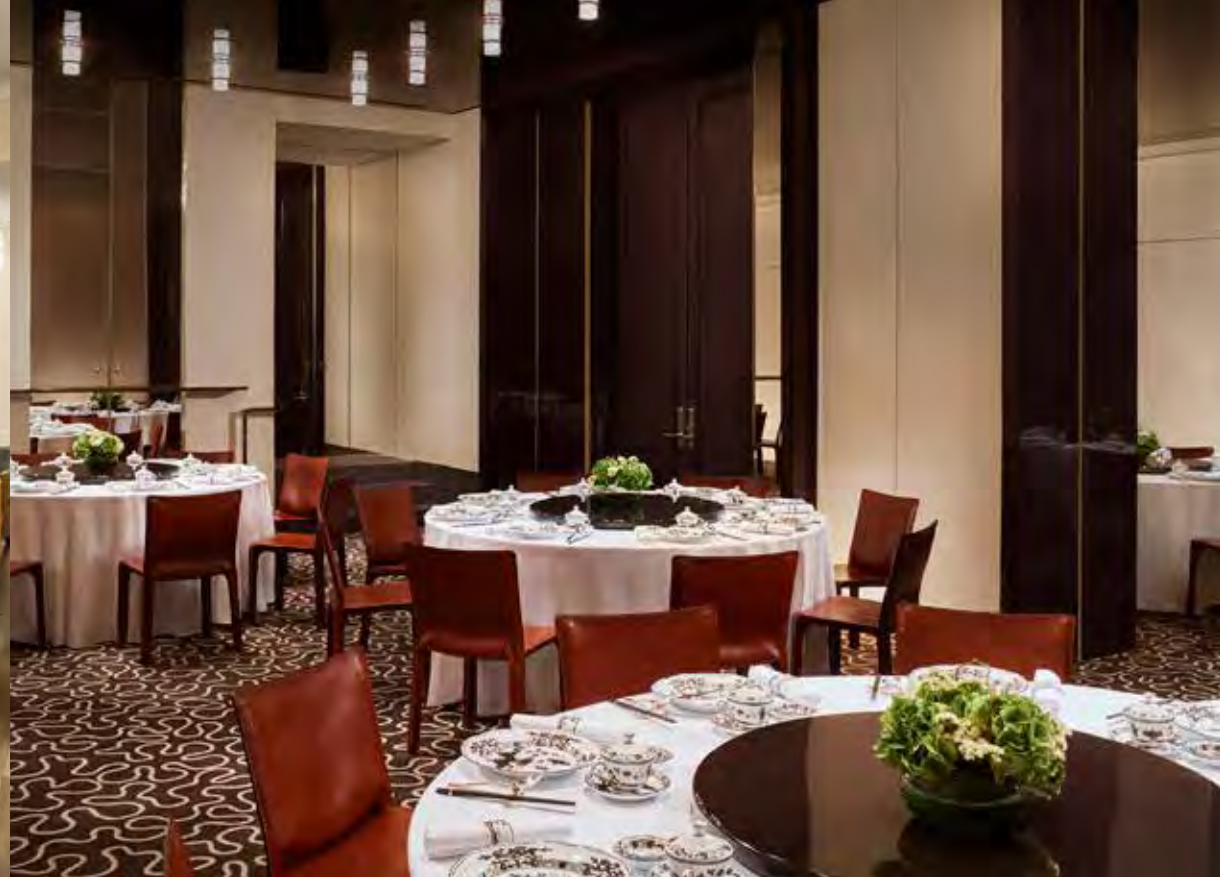
The Garden Suite

Summer Pavilion's largest private dining room, the Garden Suite — is the perfect venue for hosting intimate corporate events, extended family reunions or milestone celebrations.