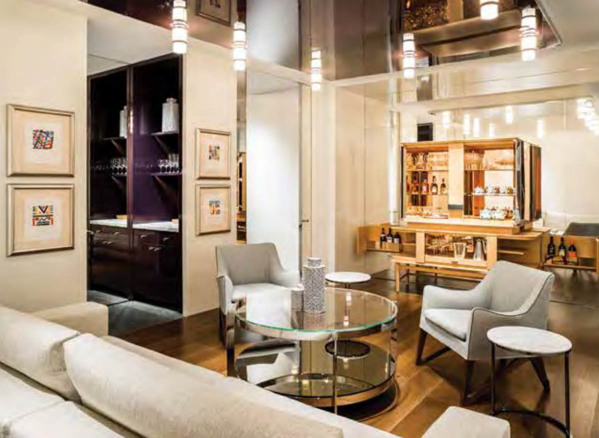
Living Room in the Garden Suite